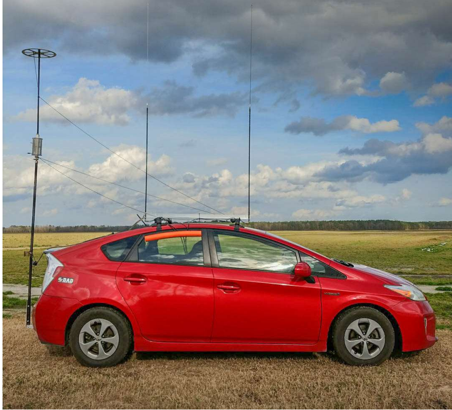
On the Pitt / Edgecombe County line

That's our "go" mobile, 2015 Prius. 80-40-20 antennas back to front. 80M is a "Texas bug catcher" on a homemade 1" copper pipe mast. Pic attached here is the rigs as they sat in the car. TS590SG on the right was the workhorse. K3 on the left rode as a spare. The laptop ran N1MM and RCForb Server, the same software used by most remote stations. Internet provided by a hotspot sitting on the dash connecting to Verizon.